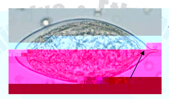
Fig.4.2. Egg of S.haematobium with terminal spine (Arrow)

5. Count the number of eggs in the preparation and report the number/10ml of urine. If more than 50 eggs are present, there is no need to continue counting. Report the count as "More than 50 eggs/10ml". Such counts indicate a heavy infection.