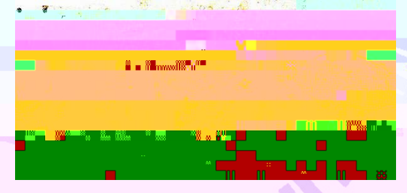
Fig.4.3. Ciliated miracidium of S.haematobium in urine.

Miracidia in urine : - If the urine is dilute or has been left to stand for several hours in the light, the miracidia will hatch from the eggs. The ciliated miracidia are motile.