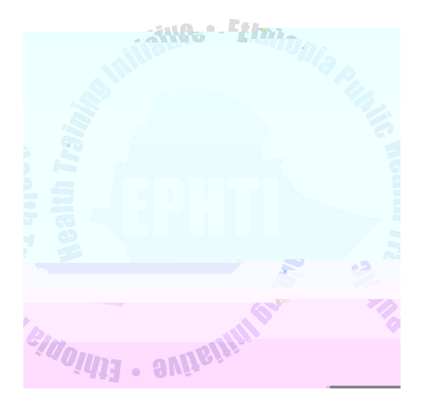
Annex 2: Abbreviations EHTTw( )3.8TwEnvironm