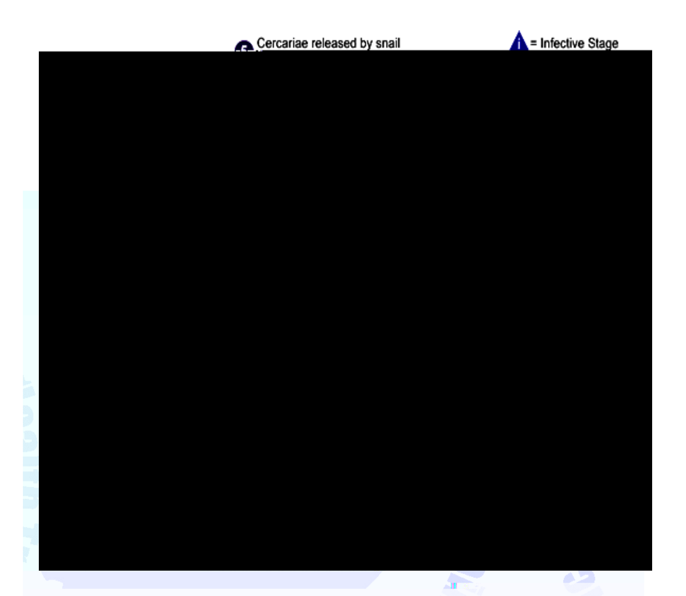
Figure-2.1. General life cycle of Schistosoma species