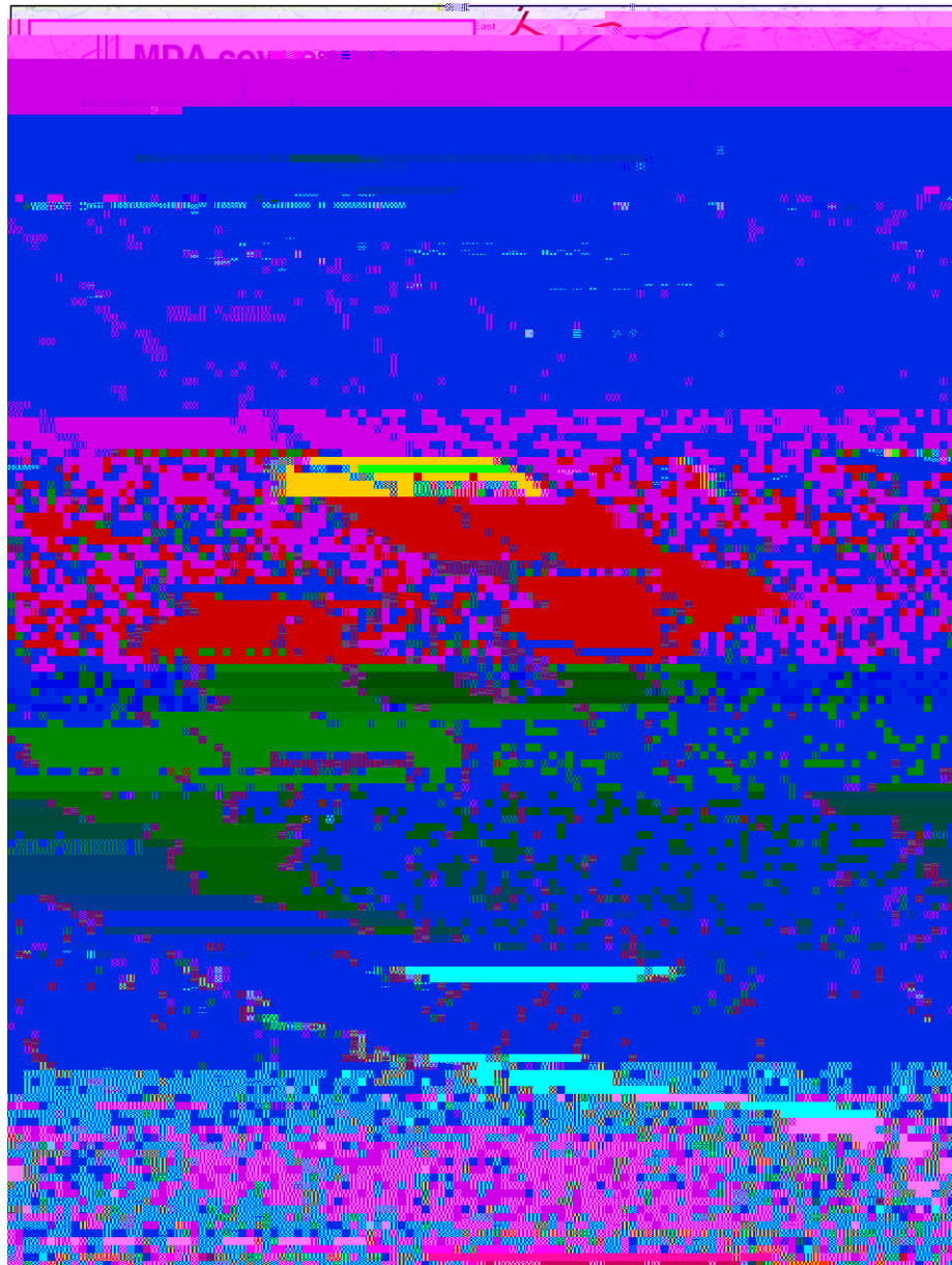
FIGURE 1. Local government areas (LGAs) treating twice per year in 2016, Edo state, Nigeria. This figure appears in color at www.ajtmh.org .

Questionnaires covered treatment compliance, conduct of MDA, knowledge of diseases, and exposure to health education. Other variables like bed net coverage and school attendance were collected for the program. This analysis focuses on coverage and conduct of MDA.