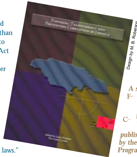
Design by M. B. Robertson

"The Parliament debated for eight months, and more than 40 amendments were made to the Corruption Prevention Act in order to strengthen it — many suggested by The Carter Center," Neuman said. "We will continue our partnership with the government, the Jamaican Media Association, the private sector, and civil society groups to ensure effective implementation and enforcement of the new laws."