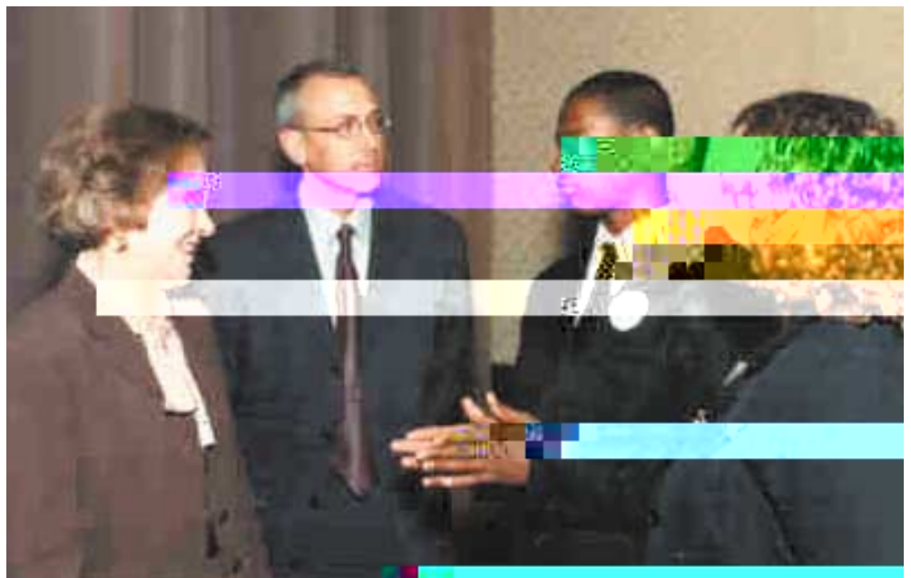
Youth participants at the Rosalynn Carter Symposium on Mental Health Policy share their stories with the former first lady and national radio talk show host Dr. Drew will contal illness to con creahth